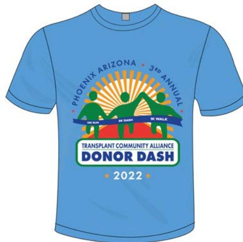
Dri-Fit Tech T-Shirt

For more event information visit: bit.ly/3eHf4Tb