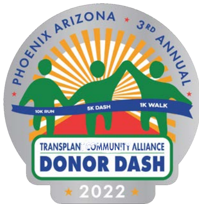
Custom Event Finisher's Medal